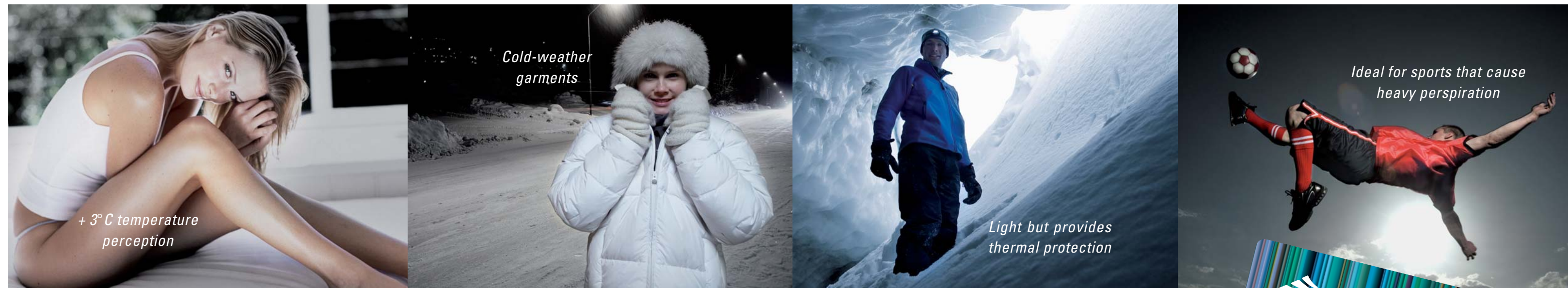
+ 3° C temperature perception