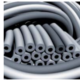
"Feel the difference"