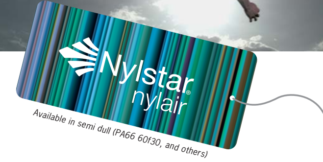
Ideal for sports that cause heavy perspiration